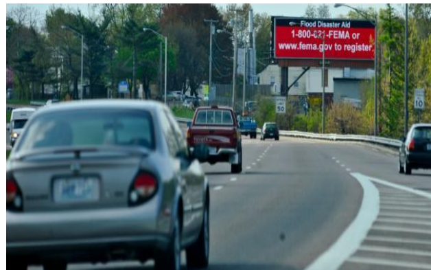
Providence, R.I., April 23, 2010 -- This advertising space, now being used for the FEMA phone number and web site, was donated on four digital billboards in Rhode Island to run PSAs on FEMA registration information. This is the digital sign along Route 10 in Cranston.

13. Proactively engage business in all emergency management phases and solicit its contribution to policy development, in light of the critical nature of private sector capabilities. We already engage the private sector in much of what we do. Moving forward, promoting further collaboration, cooperation, and appropriately close relationships between the private sector and the emergency management community will be vital. We will have to consider what legal and regulatory frameworks we will need in order to avoid conflicts of interest, since furthering our partnership with the private sector is a necessary element of serving the public in the future.