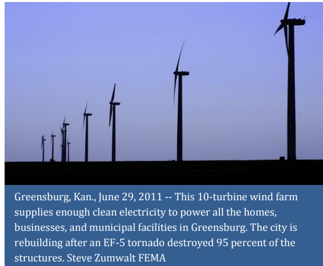
Figure 6: Greensburg, Kansas, June 29, 2011

Why this need? Future availability of important emergency supplies cannot be assured. Global and national supply chains, some of which have limited capacity to begin with, may be vulnerable to infrastructure degradation, interruptions in foreign trade, and cyber attacks, and they are undergoing radical structural changes in warehousing demand signaling and logistics. Water, especially in drought-stricken areas of the country, may not be available in sufficient amounts to fully support emergency management missions. Climate change may negatively affect access to power and energy; so may man-made problems, such as foreign conflicts and trade embargoes.