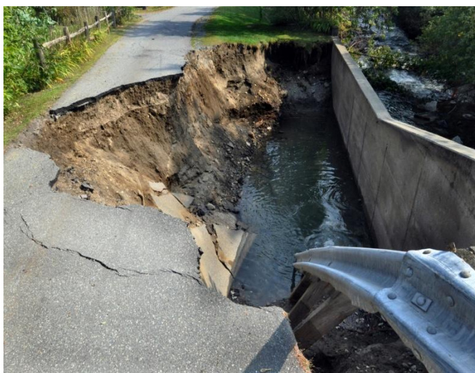
Woodstock, Vt., September 4, 2011 -- Tropical storm Irene caved in many roads after dropping more than 11 inches of rain. This caused floods which destroyed much of Vermont’s infrastructure.

Climate change can affect core emergency management mission areas and our long-term vision of reducing physical and economic loss from disasters in three primary ways: (1) impacts on mitigation, preparedness, response, and recovery operations, (2) resiliency of critical infrastructure and various emergency assets; and (3) triggering indirect impacts—population displacement, migration, public health risks among them—that increase mission risks.