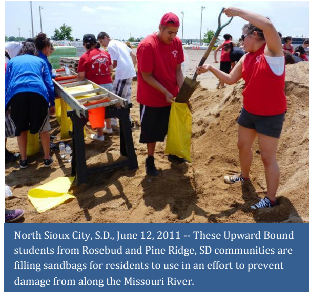
North Sioux City, S.D., June 12, 2011 -- These Upward Bound students from Rosebud and Pine Ridge, SD communities are filling sandbags for residents to use in an effort to prevent damage from along the Missouri River.

Why this need? Emergency management resources, especially personnel, are apt to be stretched in future operating environments marked by tight budgets and/or more frequent national emergencies. In some cases, skill gaps may become more pronounced, and alternative staffing models will become important. How might we further incorporate volunteers into our operating models? What limitations must we understand to mitigate undue risk exposure? Further, even though it is already used to mobilize communities, how can we better use technology to inform and organize volunteers?